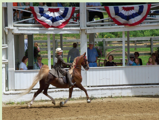
Blowing Rock Charity Horse Show, June 5-8

Every Thursday through Oct. 16 Blowing Rock Farmers Market , Park Avenue, downtown Blowing Rock, off Main Street in front of the Blowing Rock. Some of the finest in fresh fruits, veggies, whole foods and meats from local farmers. Rain or shine. 4-6pm. 828-395-7851. www.blowingrock.com