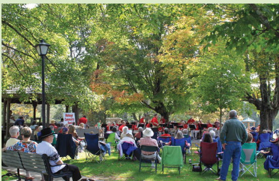
Concert in the Park, Aug. 17

Blowing Rock. Join the art galleries, restaurants and businesses on Sunset Drive for food, drinks, art and mingling. 5:30-8pm. 828-295-6991. www.blowingrock.com