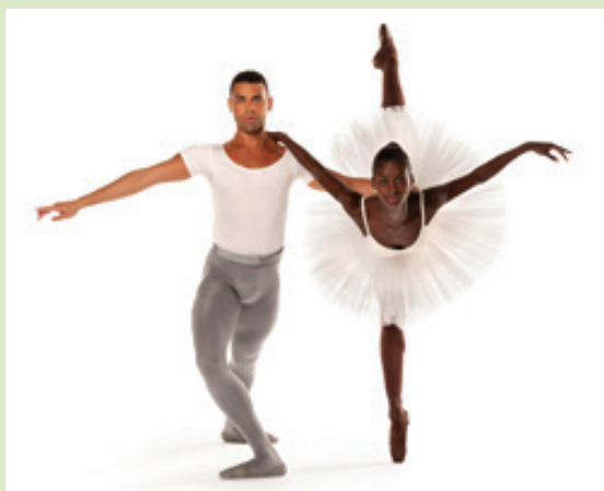
Dance Theatre of Harlem, July 19

19 Dance Theatre of Harlem , Schaefer Center for the Performing Arts, ASU, Boone. 8pm. Tickets: $28 adults, $26 children 6 and younger. 800-841-2787. www.appsummer.org