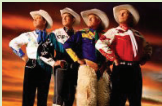
Riders in the Sky, Aug. 9 & 10

9 Summer Saturday Kids Theatre: "The Short Tree and the Bird that