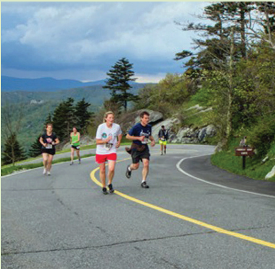
Critter Crawl, June 7