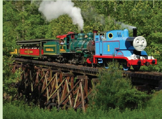
Day Out with Thomas the Tank Engine, June 6-15

6-15 Day Out with Thomas the Tank Engine at Tweetsie Railroad, Tweetsie Railroad. Park open 9am-6pm; Reservations required. Adults (age 13+) $37; Children (ages 3-12) $23; Kids 2 & under free, 800-526-5740. www.tweetsie.com