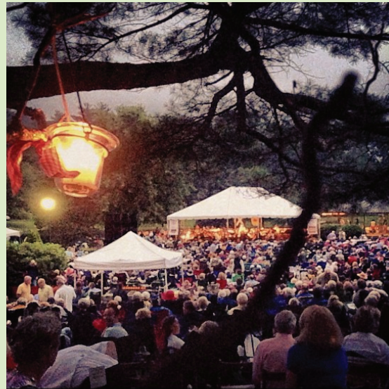
Symphony by the Lake, July 25

26 Cool Summer Nights at Tweetsie, Tweetsie Railroad. Park open 9am-9pm. Special train show rides at dusk; included with regular park admission. Adults (age 13+) $39; Children (ages 3-12) $26; Kids 2 & under free. 800-526-5740. www.tweetsie.com