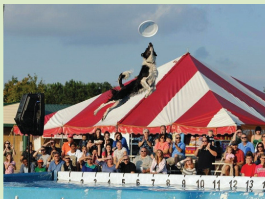
K-9s in Flight: Frisbee Dogs, July 19-27

19-27 K-9s in Flight: Frisbee Dogs at Tweetsie Railroad , Tweetsie Railroad. Park open 9am-6pm. Shows daily at 11am and 1 & 3pm; special shows July 19 & 26 at 7pm. Performance included with regular park admis-