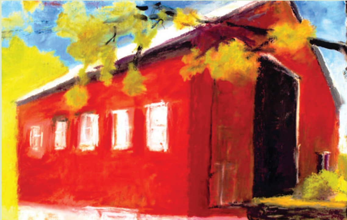
"Barns and Quilts: A Rural Tradition" at BRAHM, May 17-Sept. 28

For a complete listing of area events, visit www.blowingrock.com or www.exploreboonearea.com