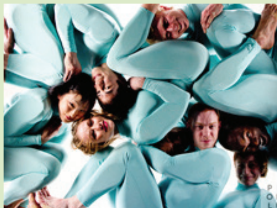
Pilobolus, July 3

4 Fireworks at Tweetsie Railroad , Tweetsie Railroad. Park open 9am-9pm; fireworks at 9:30pm. Parking: $5 per car; free for season pass holders. Buf-