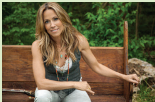
Sheryl Crow, July 24