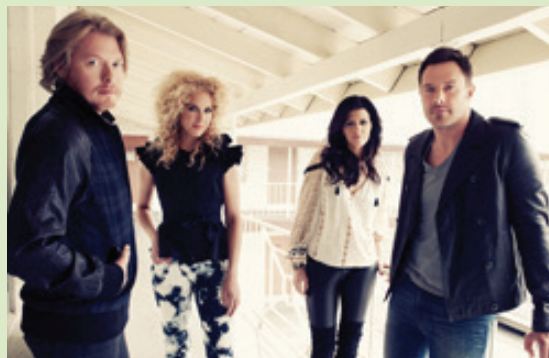
Little Big Town, June 28

28 Annual Heritage Day and Wood Kiln Opening, Traditions Pottery Studio, 4443 Bolick Road, Lenoir. 10am-until. Live music with The Dollar Brothers and Glenn Bolick and Friends, plus