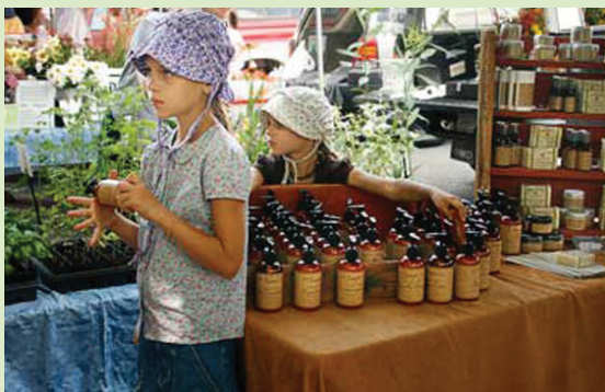
Blowing Rock Farmers Market, through Oct. 16

ply an elaborate ruse in this psychological thriller? July 26, 28, 29 and Aug. 1 & 2 at 7:30pm, July 2 & Aug. 3 at 2pm. Tickets: $21 adults, $19 seniors/students/military, $11 children under 16. 828-414-1844. www.ensemblestage.com