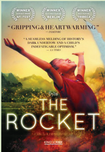
The Rocket , June 30

29 Broyhill Chamber Ensemble Reflections Series International: "Songs Without Words" , Rosen Concert Hall, ASU, Boone . Featuring works by Schumann, Brahms, Schubert and Fanny and Felix Mendelssohn. 8pm. Tickets: $20 adults, $10 students and children. 800-841-2787. www.appsummer.org