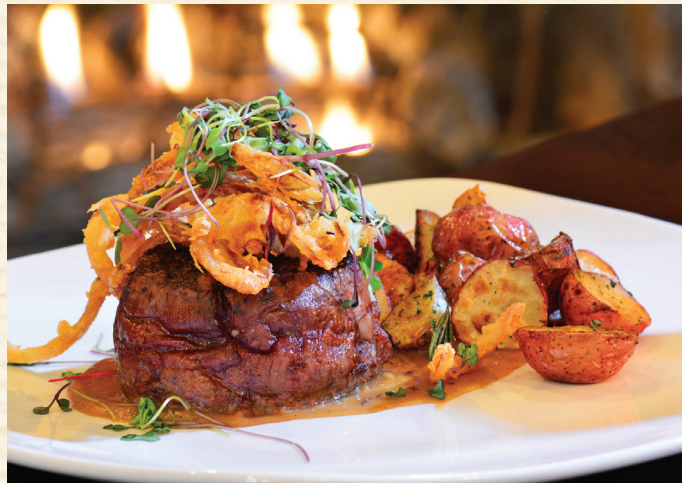
Timberlake's Restaurant table