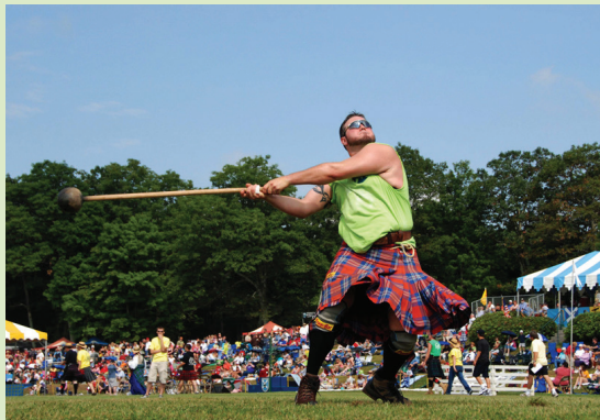
Grandfather Mountain Highland Games, July 10-13

adults, $10 children 6 and younger. 800-841-2787. www.appsummer.org