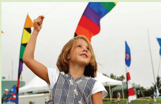
Beech Mountain Mile High Kite Festival, Aug. 31