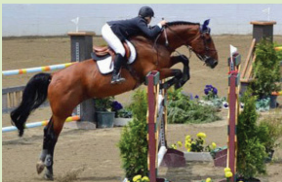
Hunter-Jumper I, July 22-27

the Performing Arts, ASU, Boone. Pre-talk at 7pm; film at 8pm. Tickets: $10. 800-841-2787. www.appsummer.org