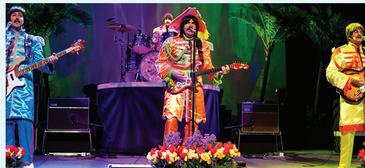
"RAIN: A Tribute to the Beatles", March 4

Closed Sun. and Mon. Admission: $7 adults, $6 seniors/military, $4 children 5+/students/groups (10+); Thursdays are Donation Day. 828-295-9099. www.blowingrockmuseum.org