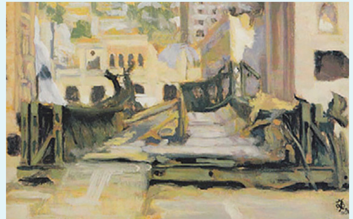
"Ruined Landscapes" at BRAHM, through March 28

For a complete listing of area events, visit www.blowingrock.com or www.exploreboone.com