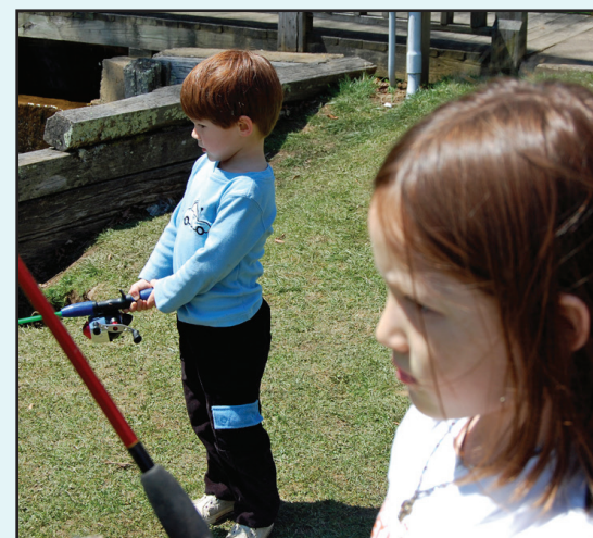
Trout Derby, April 4