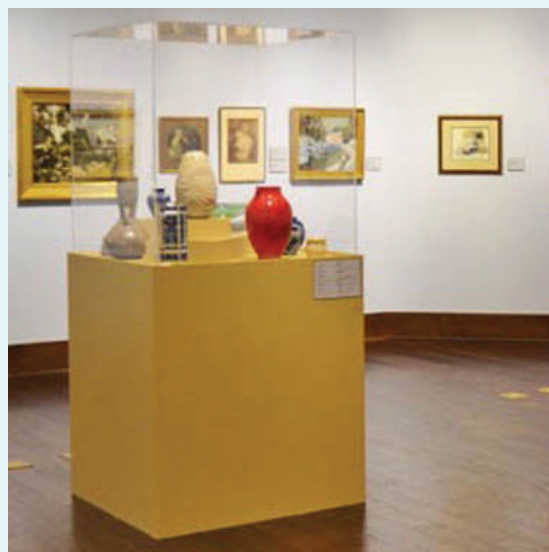
"Selections from the Collection," through April 5

Closed Sun. and Mon. Admission: $7 adults, $6 seniors/military, $4 children 5+/students/groups (10+); Thursdays are Donation Day. 828-295-9099. www.blowingrockmuseum.org