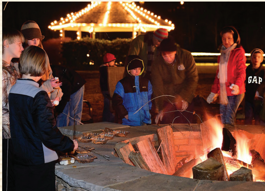
Adults and kids alike are loving our Bonfire Nights, every Saturday from 6-9pm

prayed every time we thought of saying something derogatory about our politicians, then America and our world would likely be a far better place."