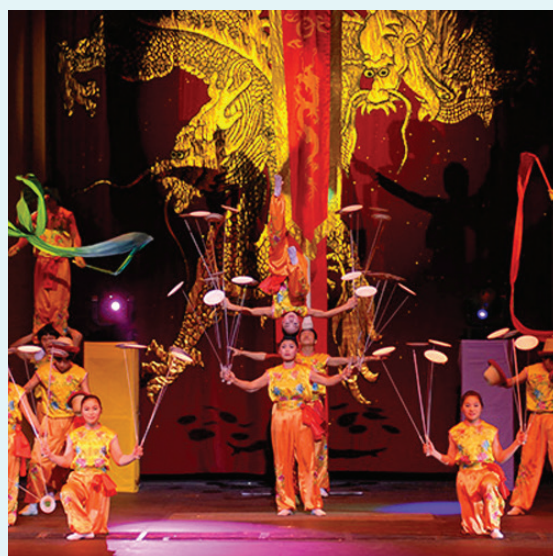
Peking Acrobats, March 17

Thru March 28 "Ruined Landscapes" , Blowing Rock Art & History Museum, 159