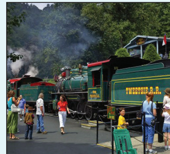
Opening Day at Tweetsie, April 10

Wine Down and more. 828-295-7851. www.blueridgewinefestival.com