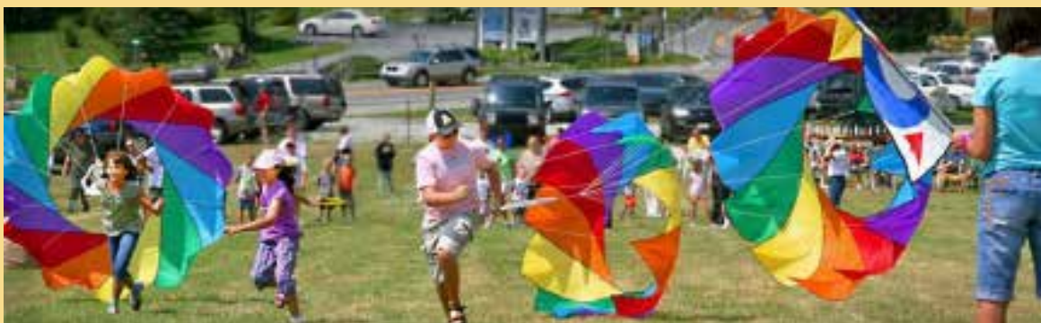
Mile High Kite Festival at Beech Mountain, Sept. 5 & 6

Through Nov. 14 “ The Sculptors Voice ”, Blowing Rock Art & History Museum . Visitors will experience different approaches to sculpture as a medium, explored and interpreted by artists across the Southeast. Hours: Tues-Wed: 10am-5pm, Thurs: 10am-7pm, Fri-Sat: 10am-5pm. Closed Sun. and Mon. Admission: $8 adults, $5 children 5+/students/military, $6 groups (10+). 828-295-9099. www.blowingrockmuseum.org