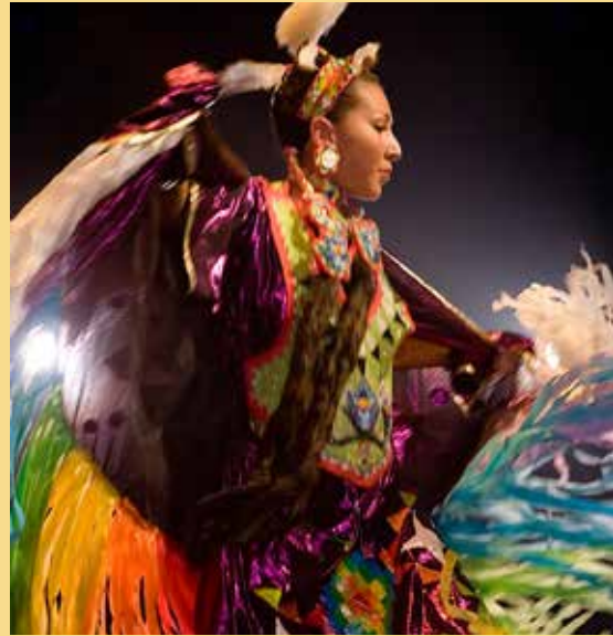
Lakota Sioux Indian Dance Theatre, Oct. 7

3 Art in the Park, American Legion Grounds, Blowing Rock. Juried art and craft show featuring 90 artists. 10am-5pm. 828-295-7851. www.blowingrock.com