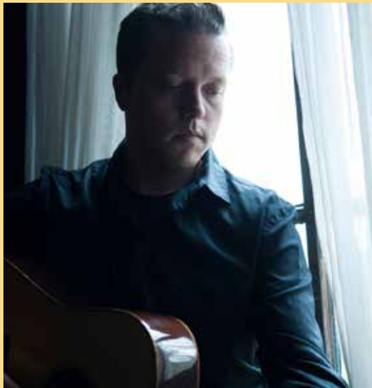
Jason Isbell, Nov. 7

More Than Free , a celebratory release that reflects his upcoming fatherhood and a forward-facing momentum after defeating addiction. 7pm. Tickets: $15-$30. 828-262-4046. www.pas.appstate.edu