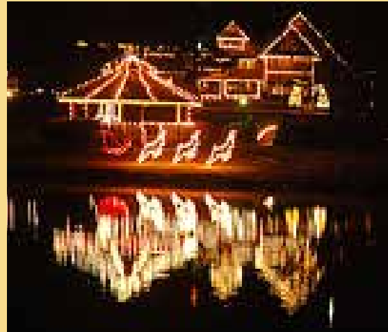
Festival of Lights, beginning Nov. 27

27 Chetola's Festival of Lights , a variety of holiday lights are turned on at dusk and remain lit through Jan. 23, 2016. www.chetola.com