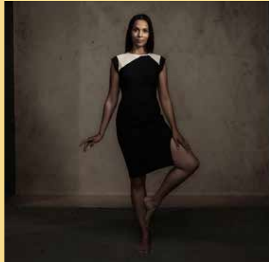
Rhiannon Giddens, Sept. 24

13 Sunday Concert in the Park, Memorial Park, Blowing Rock. 4-5pm. Free. 828.295.7851. www.blowingrock.com