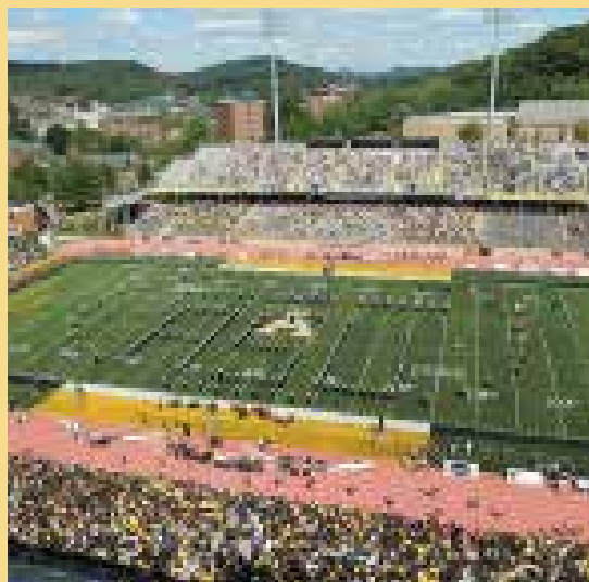
ASU vs. Howard, Sept. 5

Through Nov. 14 “The Sculptors Voice” , Blowing Rock Art & History Museum. Hours: Tues-Wed: 10am-5pm, Thurs: 10am-7pm, Fri-Sat: 10am-5pm. Closed Sun. and Mon. Admission: $8 adults, $5 children 5+/students/military, $6 groups (10+). 828-295-9099. www.blowingrockmuseum.org