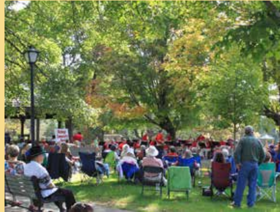
Concert in the Park, Sept. 16

29 Mountain Home Music: Afro-Lachlan Banjo and Appalachian Old-Time , Blue Ridge Ballroom, Plemmons Student Center, ASU campus, Boone. Featuring