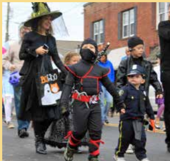
Blowing Rock Halloween Festival, Oct. 31

23 An Evening with David Sedaris , Appalachian State University, Schaefer Center for the Performing Arts, Boone . David Sedaris, NPR Humorist and best-selling author ( Naked, Me Talk Pretty One Day, Let's Explore Diabetes with Owls ), is a master satirist and one of America's most pre-eminent humor writers. 7pm. Tickets: $20-$40. 828-262-4046. www.pas.appstate.edu