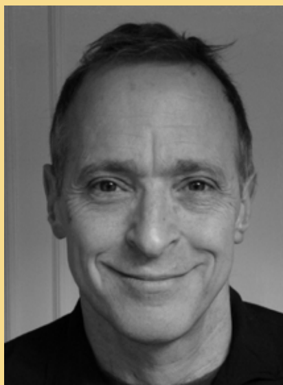
David Sedaris, Oct. 23

13 Appalachian State University's Marching Mountaineers, Appalachian