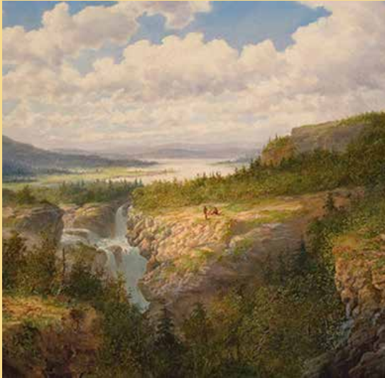
"Romantic Spirits" at BRAHM, through Nov. 2