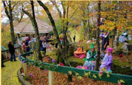
Autumn at Oz Festival, Oct. 3 & 4

Tues-Wed: 10am-5pm, Thurs: 10am-7pm, Fri-Sat: 10am-5pm. Closed Sun. and Mon. Admission: $8 adults, $5 children 5+/students/military, $6 groups (10+). 828-295-9099. www.blowingrockmuseum.org