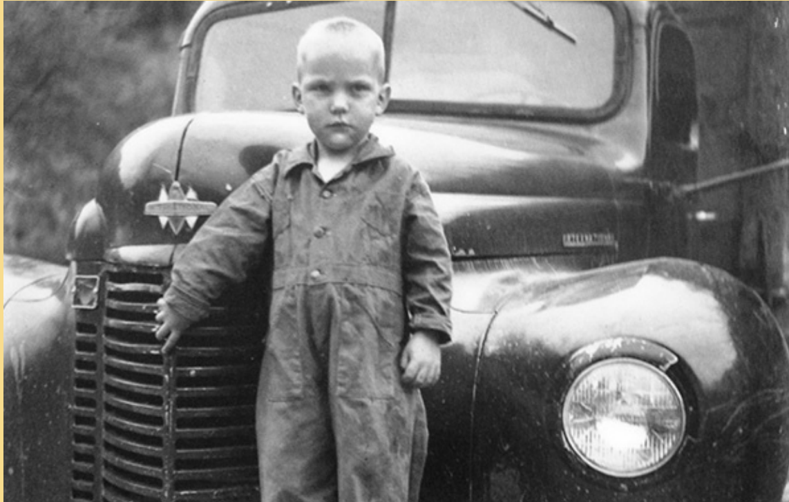
"The Picture Man: Photographs by Paul Buchanan" at BRAHM, through Nov. 25

For a complete listing of area events, visit www.blowingrock.com or www.exploreboonearea.com