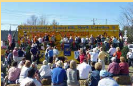
Woolly Worm Festival, Oct. 17 & 18

and living history of the North American Plains through dance, storytelling, music, narrative and ritual. 10am. Tickets: $5. 828-262-4046. www.pas.appstate.edu