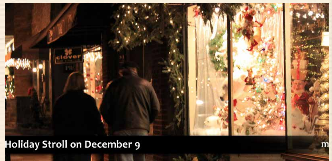
Holiday Stroll on December 9