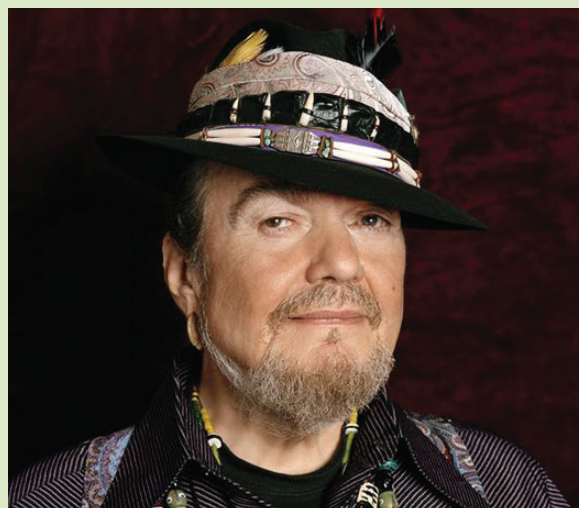
Dr. John & The Nite Trippers, Feb. 13

lake's Restaurant, Polar Plunge, Chilly Chili Cookoff, Wine Auction and Tasting, Hayrides, Bonfire, Ice Carving Demonstration, Silent Auction and more. 877-295-7801. www.blowingrock.com