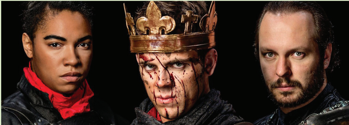
"Henry V," Nov. 30

3-6 Festival of Trees, Appalachian/Blue Ridge Room, Chetola. Purchase themed trees and wreaths; proceeds benefit Western Youth Network. Dec. 3 5-10pm, Dec. 4 2-10pm, Dec. 5 10am-10pm, Dec. 6 10am-2pm. www.chetola.com