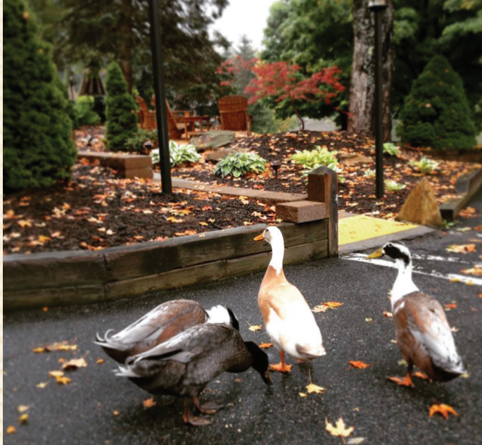
Our Indian ducks are as friendly as they are adorable.

constantly talk to each other and wander about the grounds seeking out people and new adventures. So be sure to greet them when you come by the lake this year.