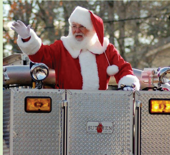
Blowing Rock Christmas Parade, Nov. 28

28 Christmas Parade , Main Street, downtown Blowing Rock. 11am. 828-