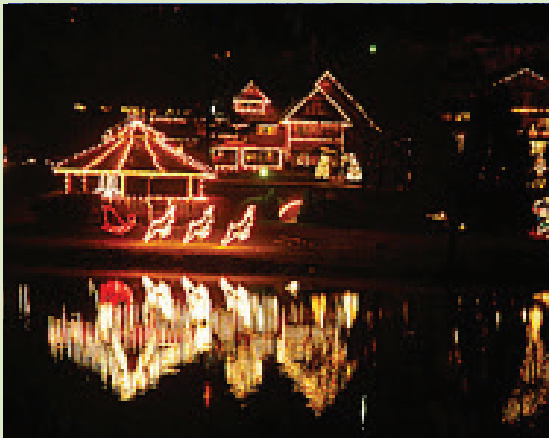
Chetola's Festival of Lights, Nov. 27-Jan. 31

tion of stepping blends percussive dance styles with technique, agility and pure energy. 8pm. Tickets: $5. 828-262-4046. www.pas.appstate.edu