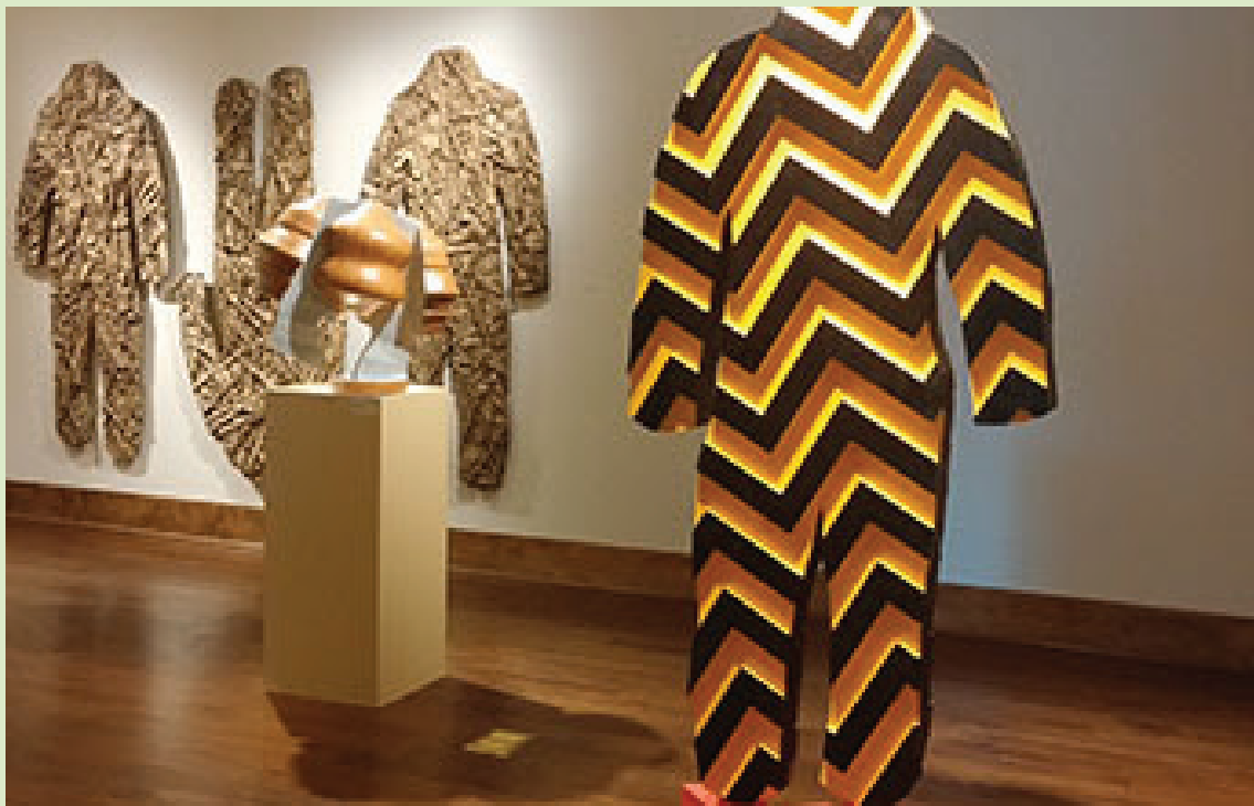
"The Sculptor's Voice" at BRAHM, Nov. 21-Feb. 20

For a complete listing of area events, visit www.blowingrock.com or www.exploreboonearea.com