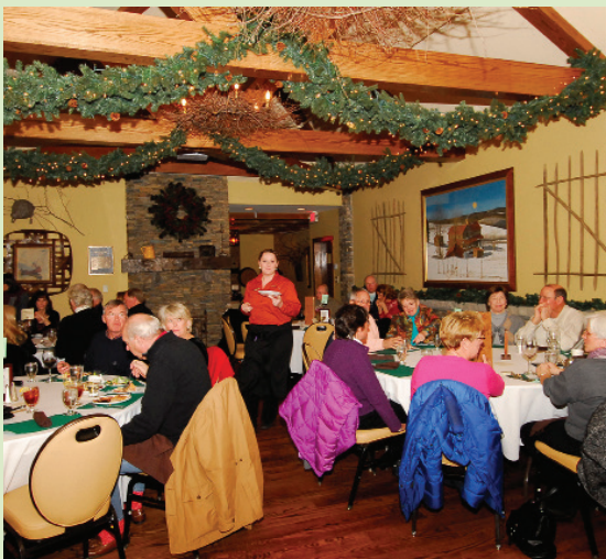
WinterFeast at Chetola, Jan. 28